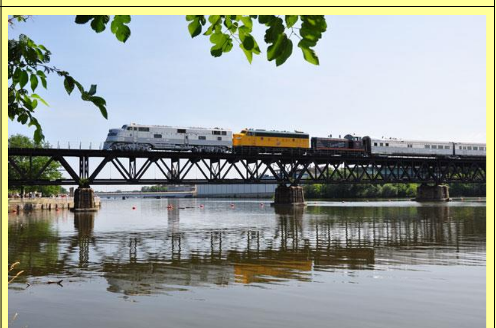
Going over the Rock River, approaching Rockford, IL.