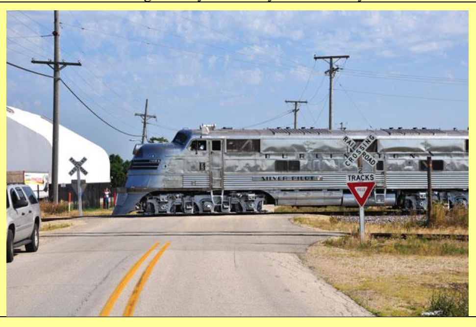
Ipsen road just west of Belvidere, IL on our way out of town.