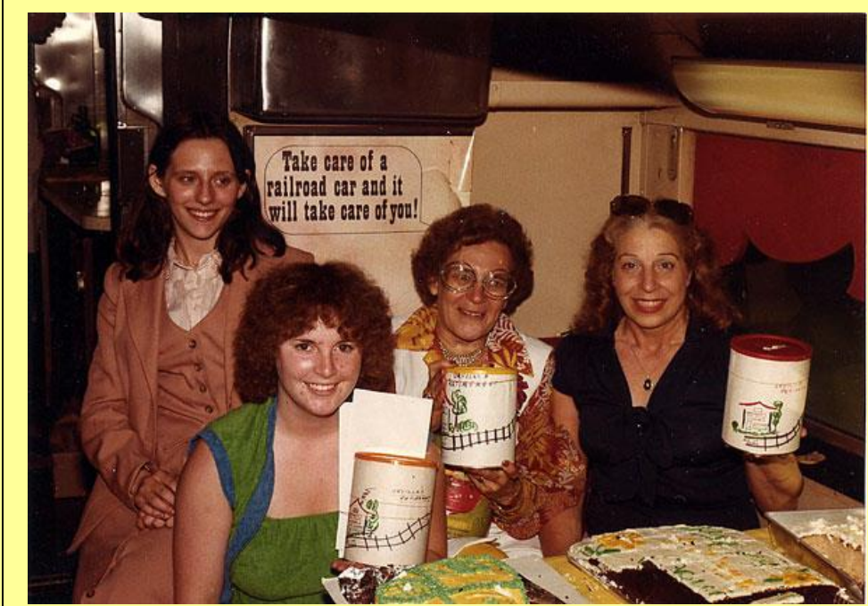
A few of the passengers.