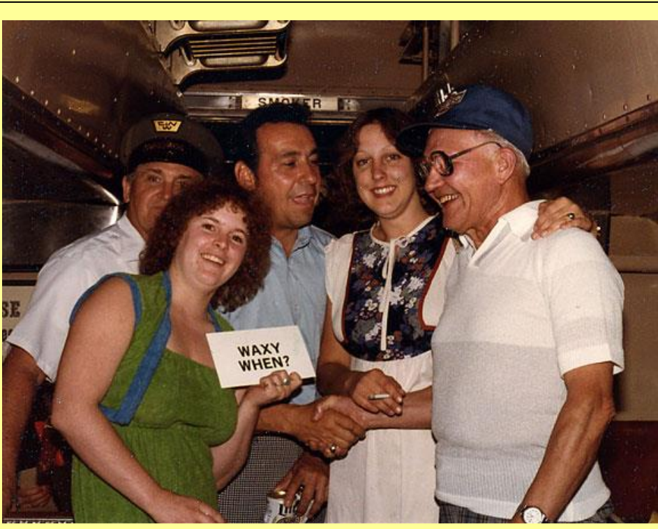
Orville and some of the passengers – with a question for “Waxy!”