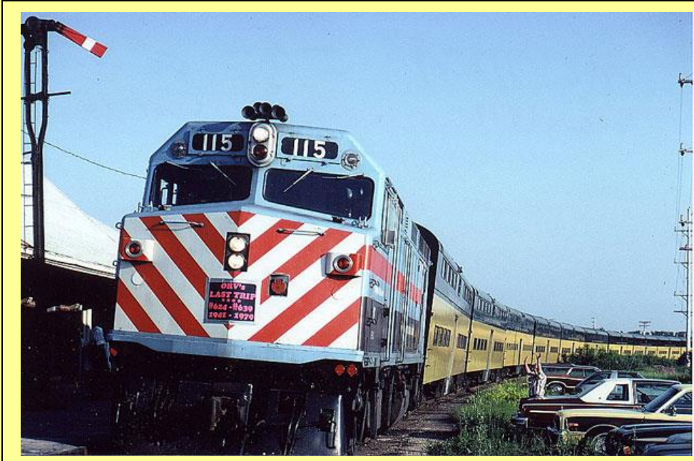
Train No. 639 has just arrived at McHenry. Note the sign on the engine - “Orv’s Last Trip, #624 - #639, 1941 to 1979.”