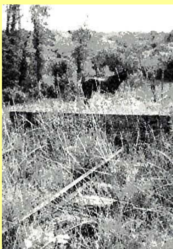
This was the “end of the line” – about 300 yards west of the depot.