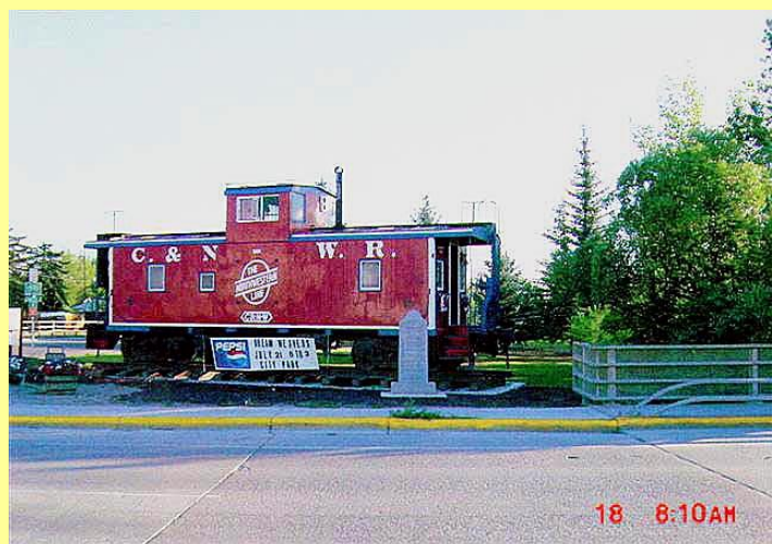
A C&N W.R. waycar is preserved in a city park.