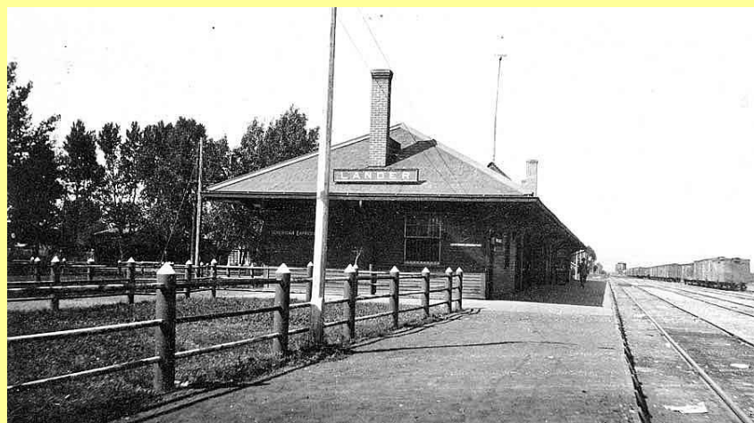
This is how the Lander Depot looked in about 1915,