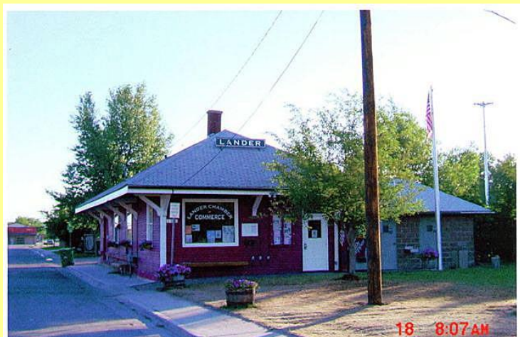
The Lander Depot today – restored & used by the Chamber of Commerce.