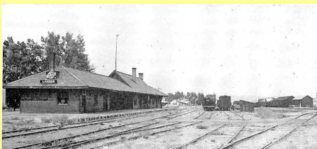
Another view taken in the 1940’s, looking east & showing the yards.