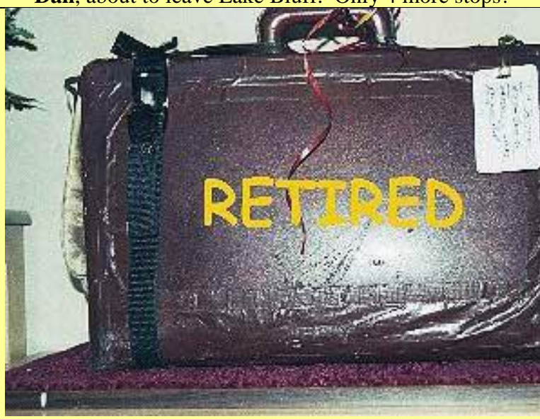
This one says it all!