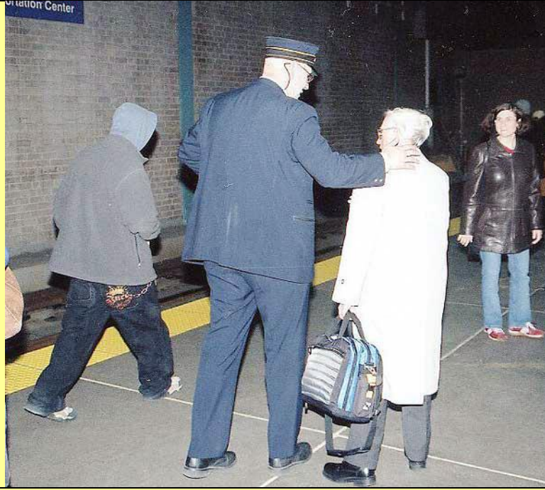
Here's another lady who will miss him.