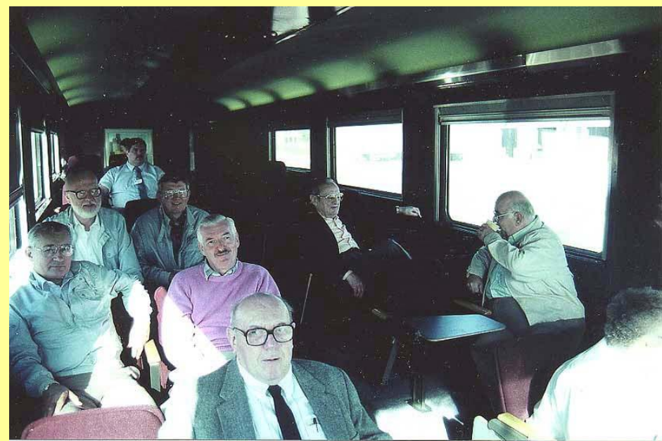
November 1990 Retirement Special to Rockford. Who recognizes these guys?