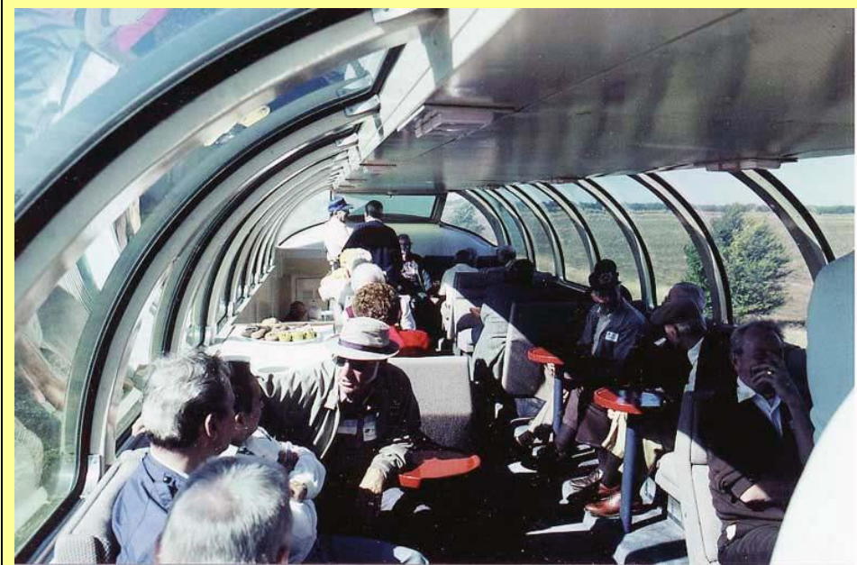
November 1990 Retirement Special to Rockford - in the dome car.