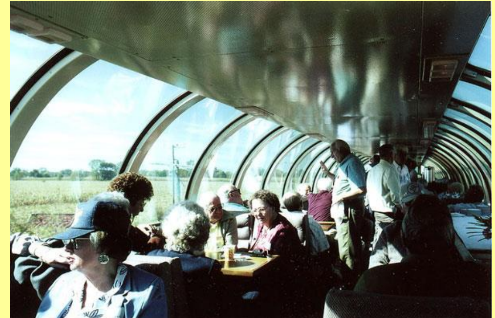
Another one in the dome car.