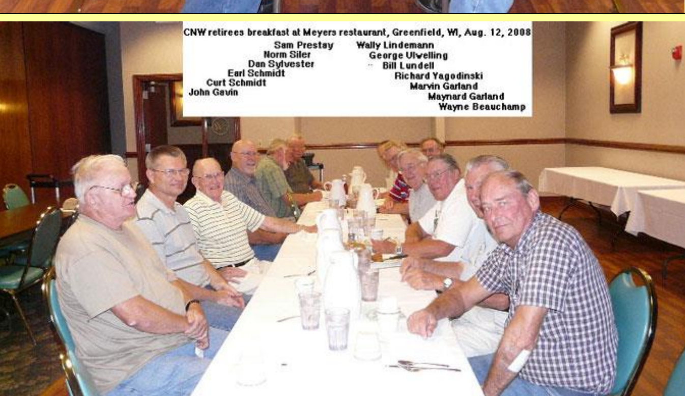
The Milwaukee Chapter has a breakfast at 8:30 am on the second Tuesday each month at Meyers Restaurant, 4200 South 76th Street, Milwaukee, WI 53220. Here's who was there on August 12, 2008, from both end of the table.