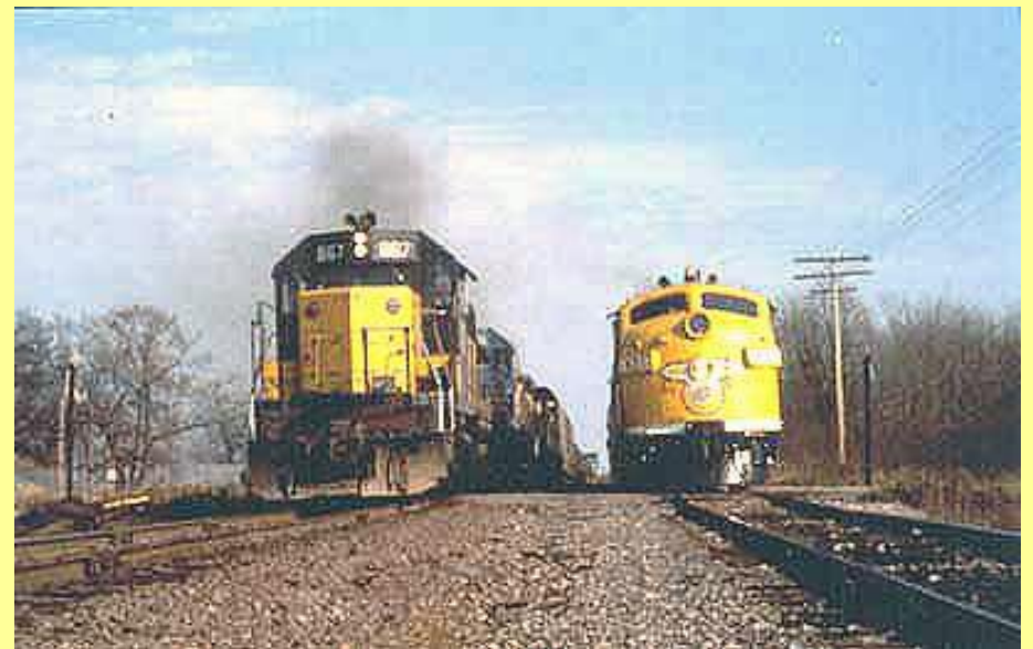
Necedah, Wisconsin in 1979 or thereabouts. No. 415, (Chicago / Itasca) is passing an inspection train coming off the connection to the MILW line to Wisconsin Rapids -- where we had trackage rights. For the historians, eng. 867 on No. 415 was the very first "production" SD-40. Another -- lesser known, C&NW first.