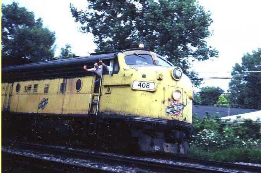
The 408 at Villa Park. Does anyone recognize these guys?