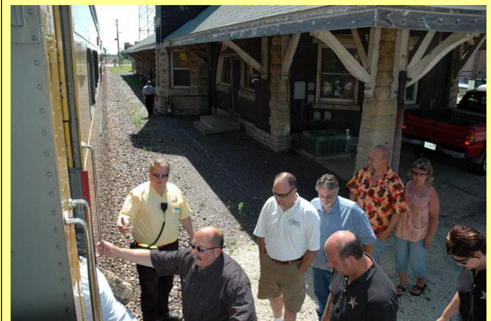
Taking on passengers at DeKalb.