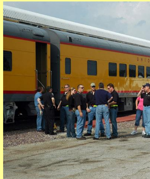
Just before boarding at West C